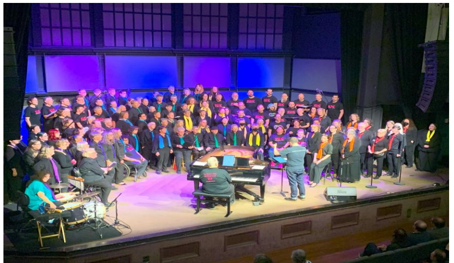
EGMC & SOROMUNDI SHARE THE STAGE